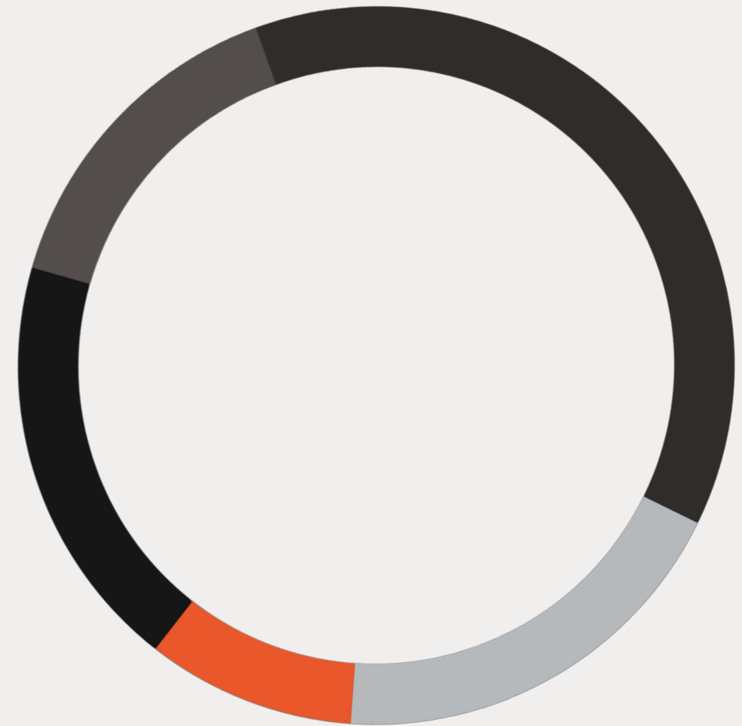
SHARE OF GLOBAL WEALTH

Ecatur, con rem et id qui omni et, utatusda videliq uidundist hit quaspere, es il evel maionsed ut id ut qui nim accaepudici quostiis adicidu ntempor escidunto volupti conem. Voloreh endero inulparum quatia non ex es niatempus et quis nisque