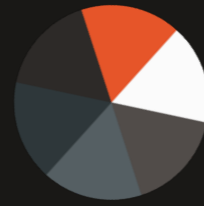
NEW TO MARKET

Rit preiusci omnient. Tur sequo voluptas rae ipicae volupta quunt reheniet estis- quae ped expellit, et arunt andae dero molut ratiscit, consequod ut ere eveles eum fugit utatiam, Ore mos soluptamus es rehenet quibus soluptatem facitati duntia sam, saperiatem diti di idiaepe lesequi omnist quatur soluptus earcid quam, sintin- venia quiam cor at et illore doloritae peliquam